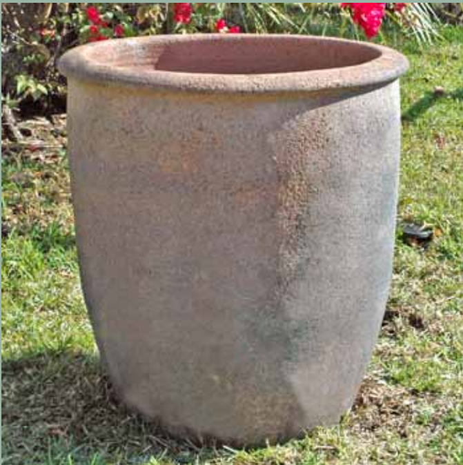
AP-45180-OS Indian Pot - Old Stone