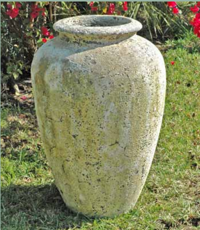
AP-46094-AD Alibaba Jar - Atlantis