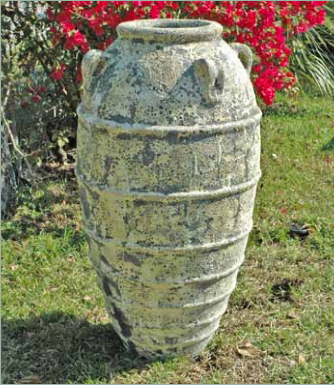
AP-46214-AD Kos Jar - Atlantis