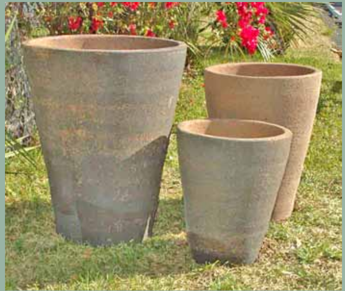
AP-45019-OS Giant Crucible Pot (Set of 3) - Old Stone