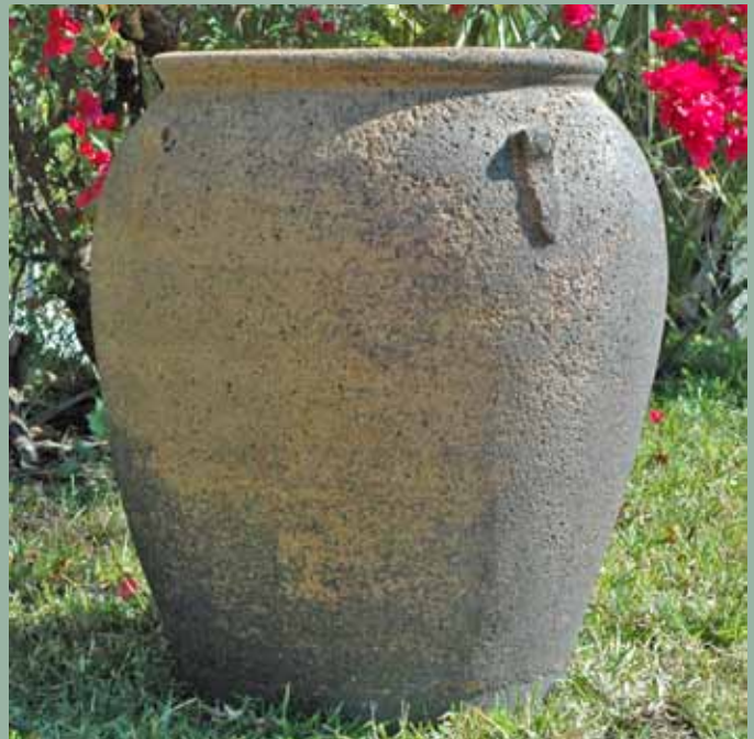
AP-45150-OS Honey Spoon Jar - Old Stone