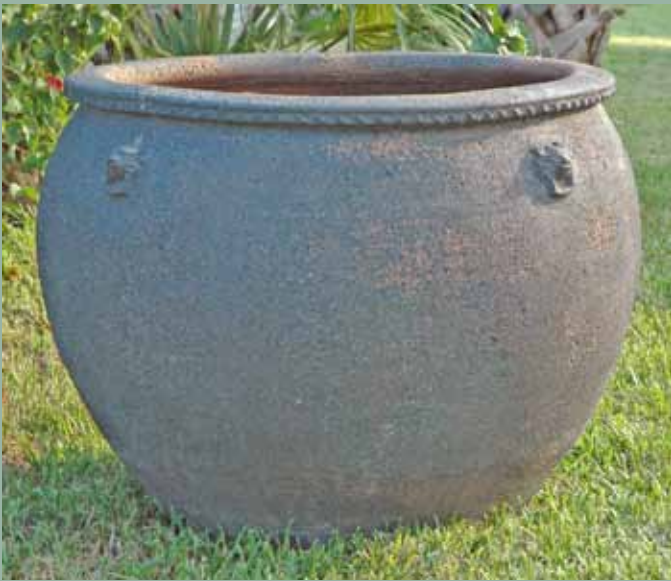
AP-45016-OS Lion Head Pot - Old Stone