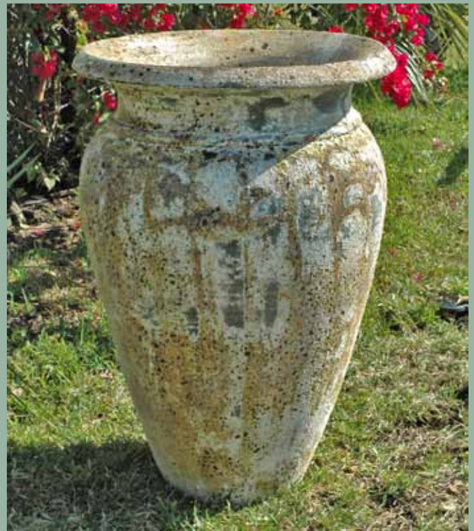
AP-46018-AD Pharaoh - Atlantis