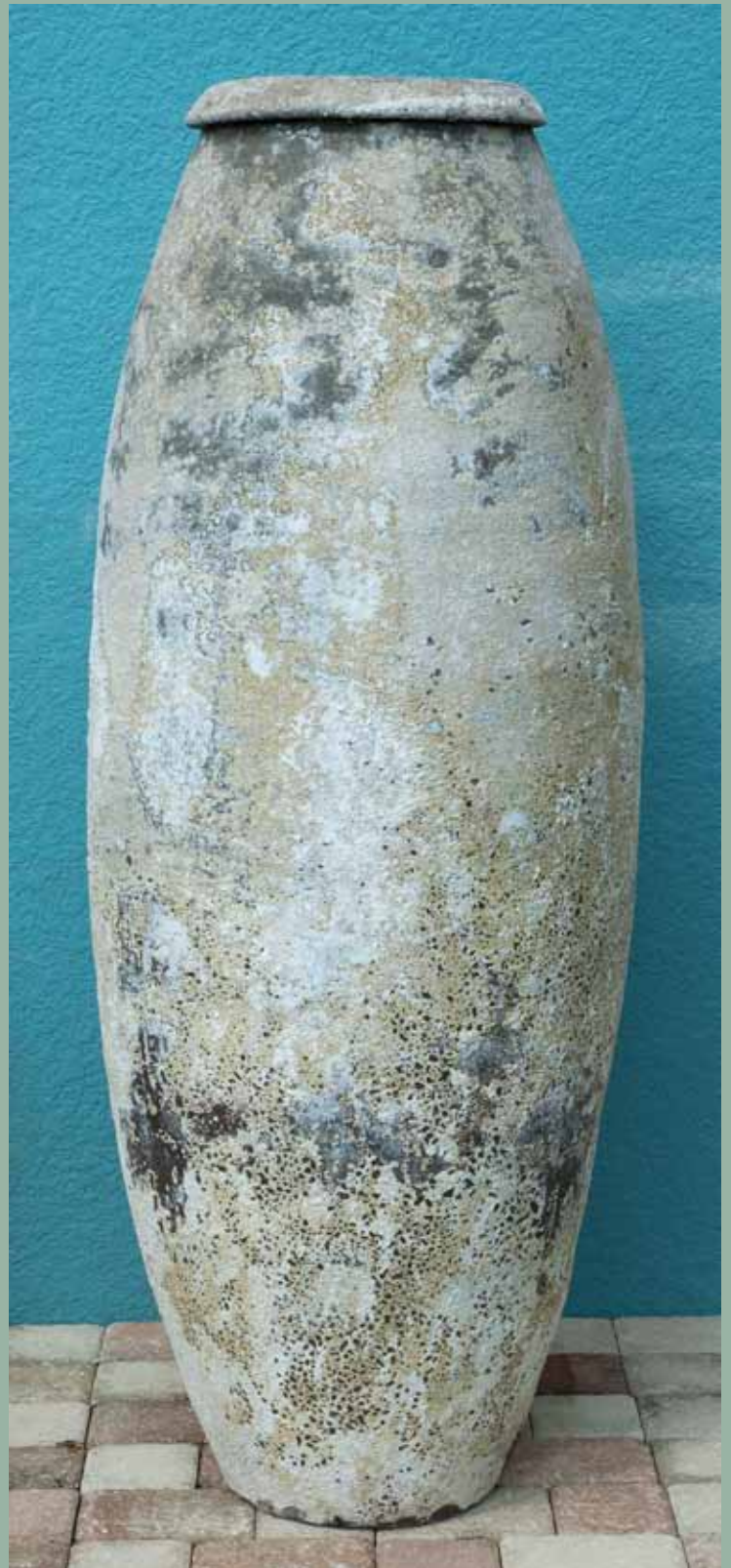
AP-46402-AD Spartan - Atlantis