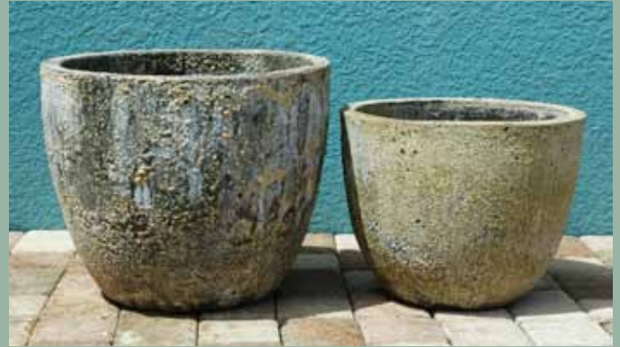
AP-46076-AD (Set of 2) Egg Planter - Atlantis