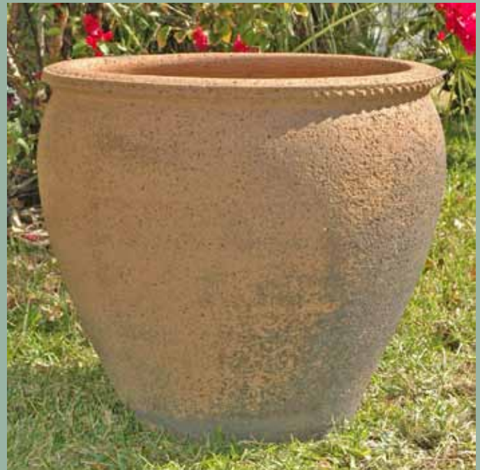
AP-45020-OS Salty Egg - Old Stone