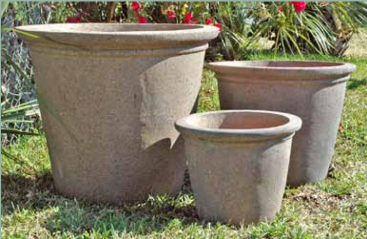
AP-45184XL-OS Sala Pond - Old Stone