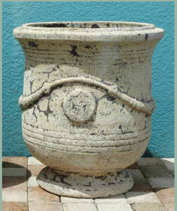
AP-46023-AD French Urn - Atlantis