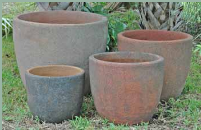
AP-45366-OS (Set of 4)