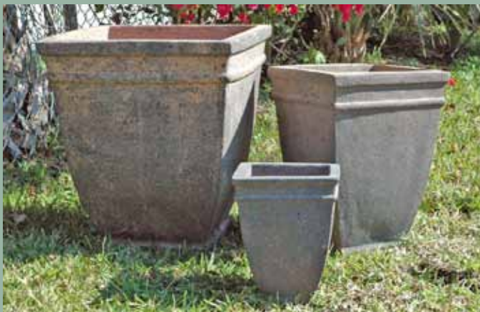
AP-45172-OS (Set of 3)