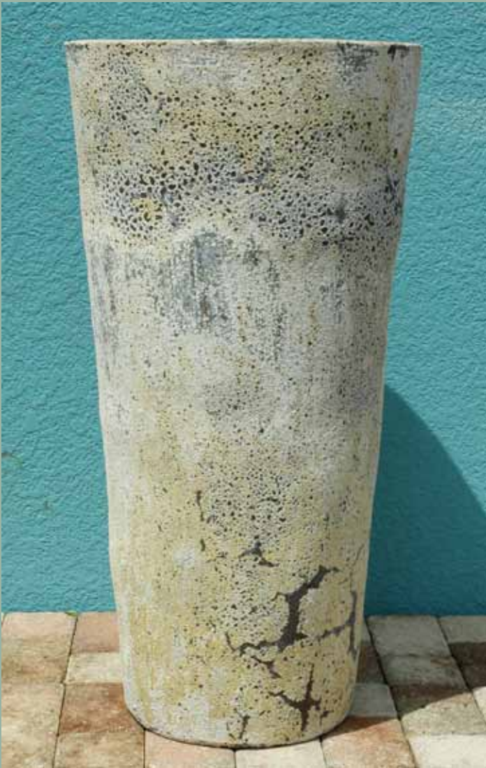
AP-46400-AD Sana - Atlantis