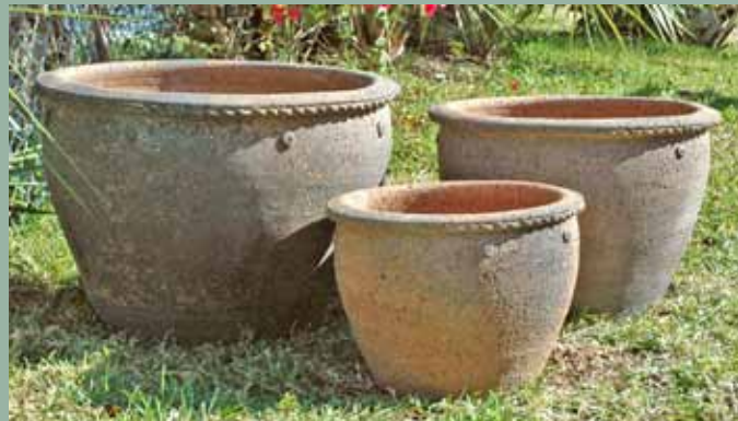
AP-45014-OS (Set of 3)

THE POTS ARE HIGH FIRED, THEN SANDBLASTED TO ACHIEVE AN UNIQUELY BEAUTIFUL, VERY DURABLE SURFACE.